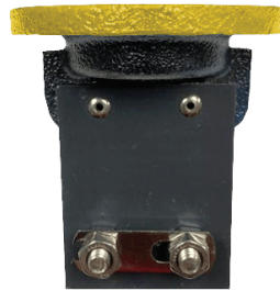
Part Number: TPITAD-2T-***