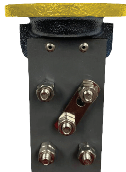
Part Number: TPITAD-5T-***

TracerPit All-Duty 2 or 5-terminal test stations are a ground level, direct connection, access point featuring 2 or 5 terminal lid. It provides direct connection for locate technicians to hook their transmitter to within a tracer wire system. Features a locking lid design that works well in cold weather.